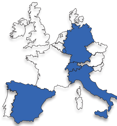
■ Neighbouring countries with prohibitions